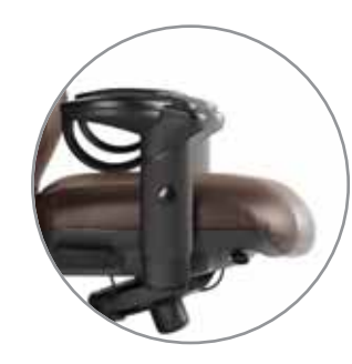
Adjustable seat depth push button on edge of seat and slide seat to match leg length.